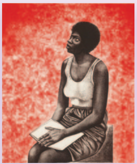
"Red Leaves" by Elizabeth Catlett