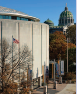
The State Museum of Pennsylvania